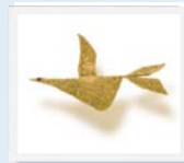
GEORGES BRAQUE (1882-1963)

In 2015, Bonhams achieved a world record for a Grima jewel (£1,482,500); my own favourite is this characteristic, highly textured green tourmaline, diamond and gold “sunburst” pendant necklace from 1972 which makes me feel happy.